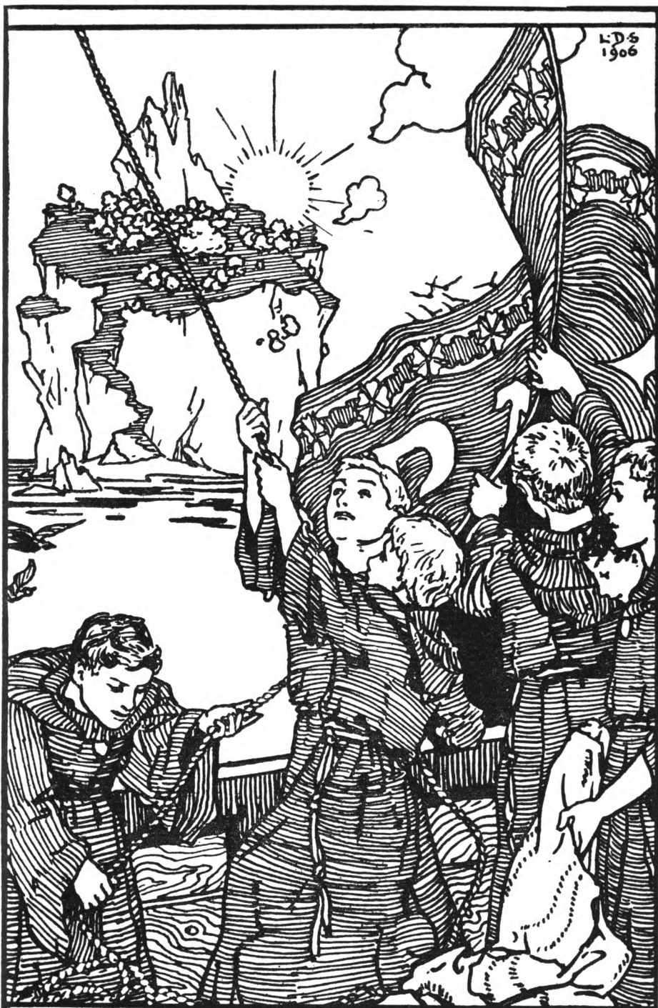
The Isle of Sacerdotium .